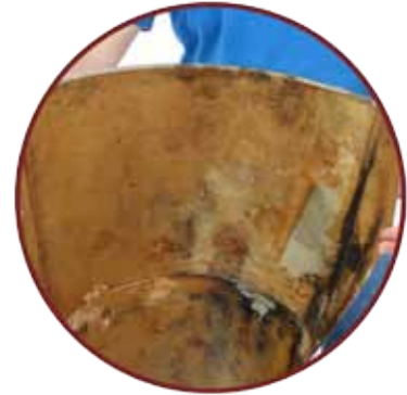
Example of polykraft use that led to corrosion of aluminum jacketing

Contact ITW Insulation Systems for more information on this corrosion science, lab testing, and field examples